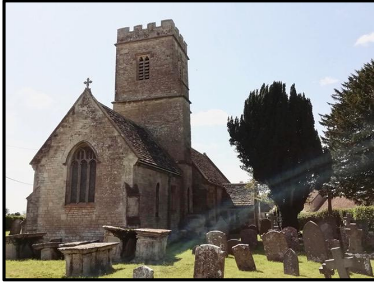
ALL SAINTS CHURCH, LITTLETON DREW